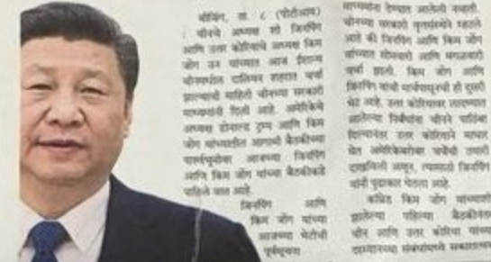
जिनिंग-किम जोंग यांची खलबते