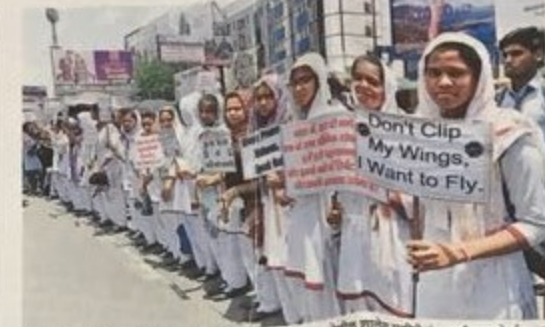
मल्ल्याची मालमत्ता जमीचा मार्ग मोकळा